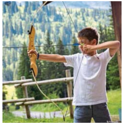
It's a bullseye! One of many activities in Flaine

We found something here for everyone, including for us all to do together, which is a rare and special thing with older kids